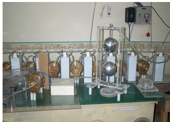
Fig. 4. Eight stage Marx generator in air

In Fig.1.output voltage is 121kV, while capacitor charging voltage is 16 kV. Ideally the output voltage for 16 kV charging must be 128 kV, but some voltage drops occurs across each spark gap switch. In Figure 2 charging voltage has been increased from 16 kV to 18.6 kV. For this charging voltage output is 142 kV. A copper sulphate voltage divider is under development stage, when completed it could measure upto 1MV. Beyond 150 kV, spherical spark gap measurement has been employed for voltage measurement.