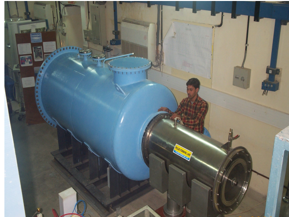
Fig. 3. Marx tank with PFL